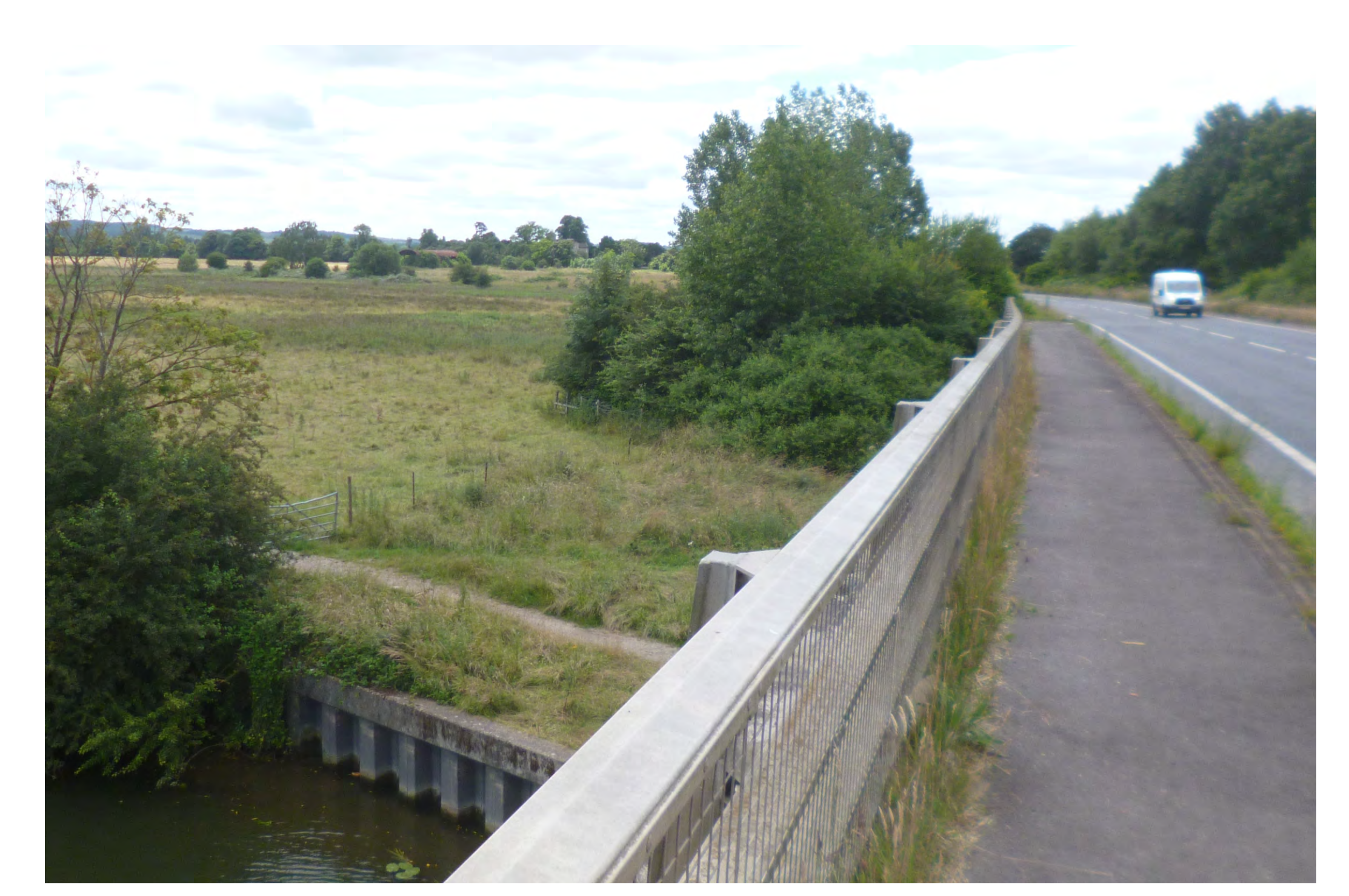
View from Winterbrook Bridge - Nosworthy Way (Wallingford Bypass)

There is one Public Right of Way (the Thames Path National Trail) within the landholding. This Public Right of Way travels north south along the bank of the Thames River.